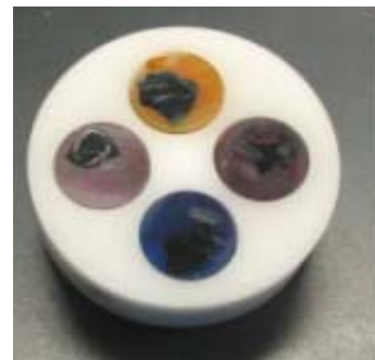
US MA SH-V1